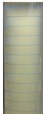
Too much yeasts with respect to the quantity of CLARIFIANT XL™