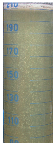
Optimal ratio of yeasts / CLARIFIANT XL™

In general, for optimal riddling, we advise a quantity of 0,04 to 0,05g of bentonite/bottle.